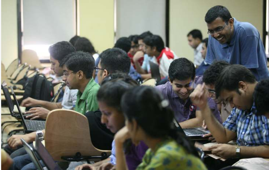
Students at Indian Institute of Technology.

that modernity is trying to reinforce and reproduce the identity it was supposed to deconstruct!"